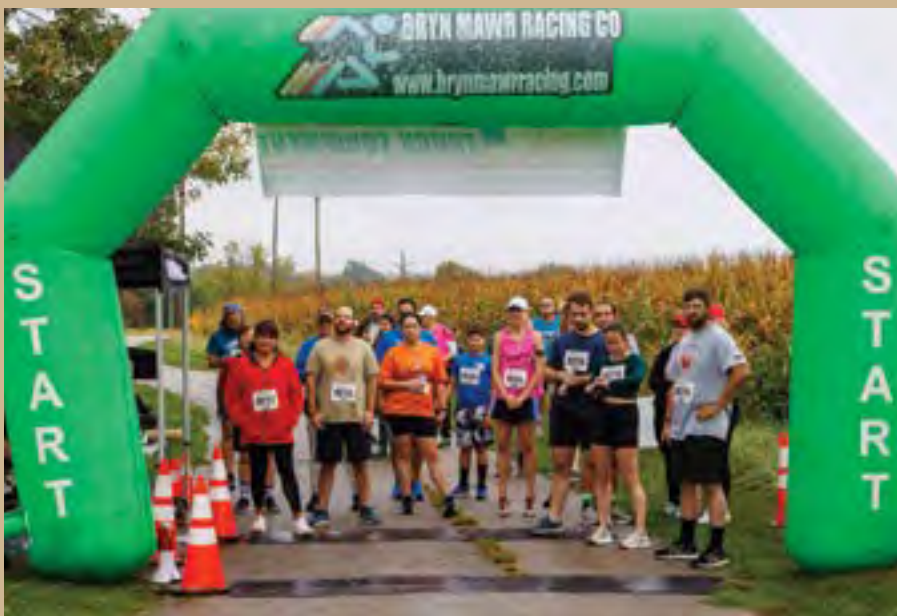
5K Starting Line

closest to the pin contest, and a hole in one contest for a $5,000 cash prize. After all golfers were done their round, we joined together for dinner, fellowship, and awesome donated raffle prizes. Together, we raised $15,000 which goes directly to the Foundation and its mission to support our community.