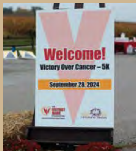
Victory Over Cancer Sign

The Victory Bank Foundation continued its "Community Commitment Beyond" banking by hosting the 3rd Annual The Victory Bank Foundation Golf Outing back in May at Brookside Country Club in Pottstown. This year's event was bigger than ever with more golfers and more sponsors! Our golf outing is primary source of raising funds for the Foundation so we can continue to provide meaningful contributions to non-profit organizations and causes for those most disadvantage in our community. For the third