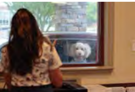
Drive-Thru Special Visitor

The Victory Bank rolled out the red carpet for the Grand Opening of our brand-new Horsham Branch, and what a week it was! From June 2 through June 6, we welcomed the community with exciting events, great food, unforgettable entertainment—and some incredible prizes! Each day brought a new theme and a special celebration.