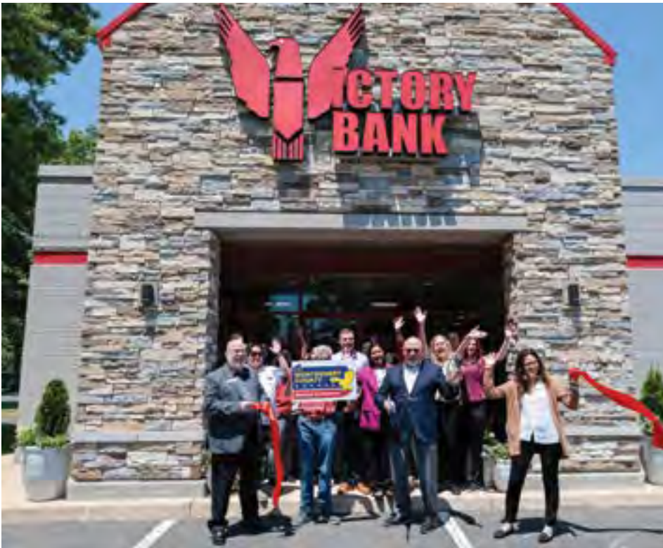
Monday Ribbon Cutting with Montgomery County Chamber of Commerce, Township Officials and Victory Bank Employees

June 2 – June 6, 2025 | 100 Gibraltar Road, Horsham, PA 19044